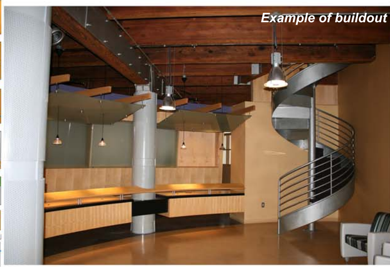
Example of buildout