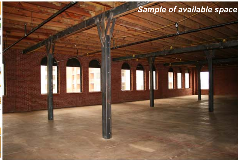
Sample of available space