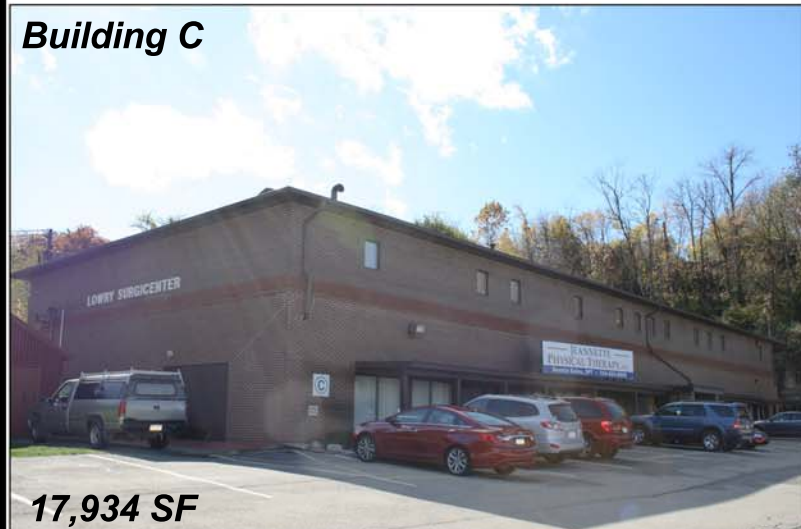
Building C 17,934 SF Two-Story brick masonry building 8,881 SF floorplate