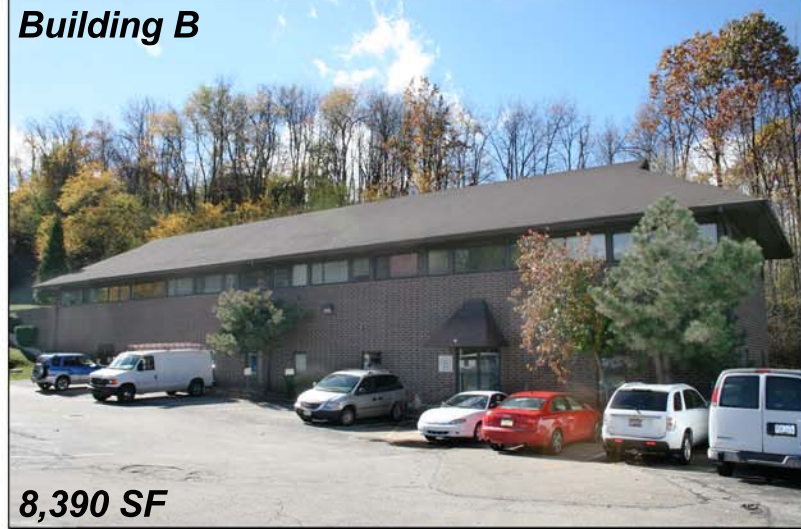
Building B 8,390 SF Two-Story brick masonry building 4,323 SF floorplate