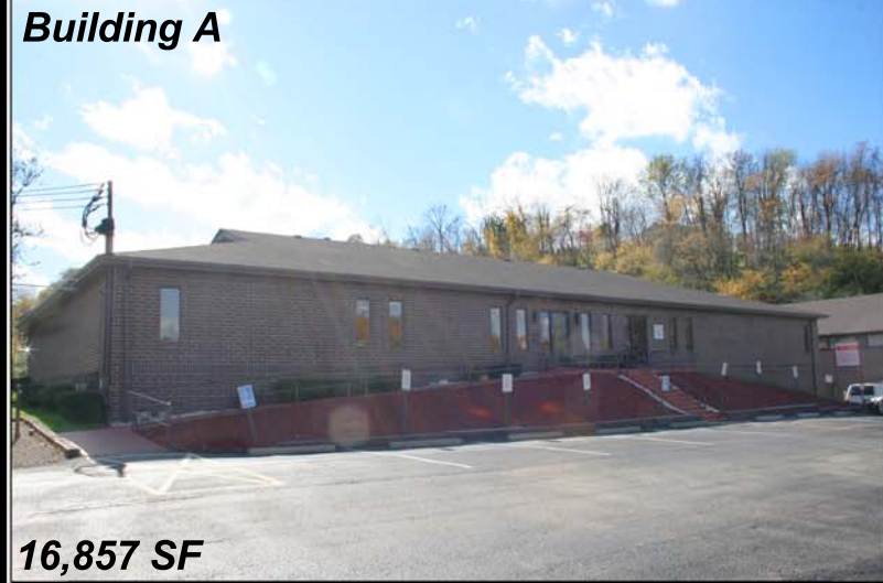
Building A 16,857 SF Two-Story brick masonry building 8,429 SF floorplate