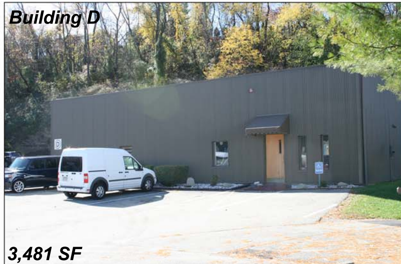
Building D 3,481 SF One-Story metal panel over concrete block